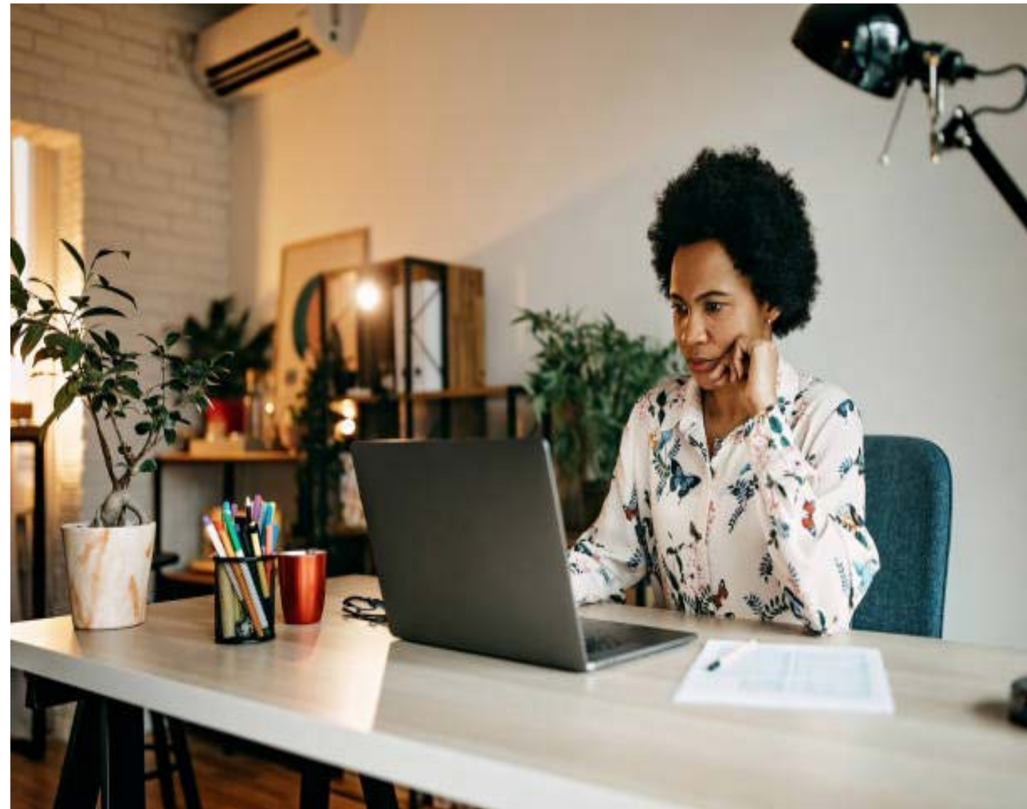
Sole Proprietors CRB Type Program