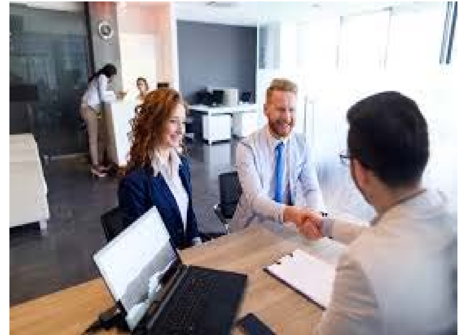
Travel Agencies CEWS, CRS, HASCAP